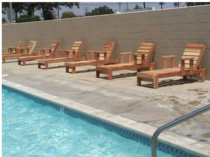
Note: Photo taken before pool deck wall was painted aqua.

We have purchased eight (8) chaise lounges and four (4) picnic tables for the pool deck. They have been treated with several coats of polyurethane to withstand the sun and water. The tables have holes for umbrellas, and the chaise lounges have tabletops with umbrella holes (per chaise pair.) We ask that you do not move the new patio furniture around the pool deck so that they will last a long time. (The other patio furniture was eventually damaged beyond repair from being repeatedly dragged around the pool deck.) Please help us keep the pool deck looking nice for you and your family. The pool deck inner wall has also been painted a soothing aqua color to give the deck a nice "beach feel." Please join us for the End-of-Summer Social to see the other finishing touches we will bring to the LGCA pool deck!