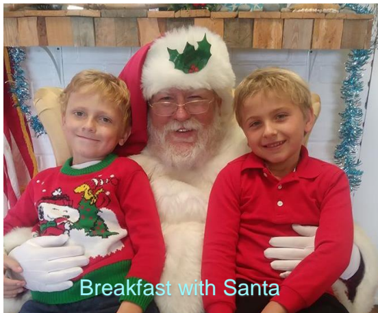
Breakfast with Santa