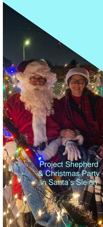
Project Shepherd & Christmas Party in Santa's Sleigh